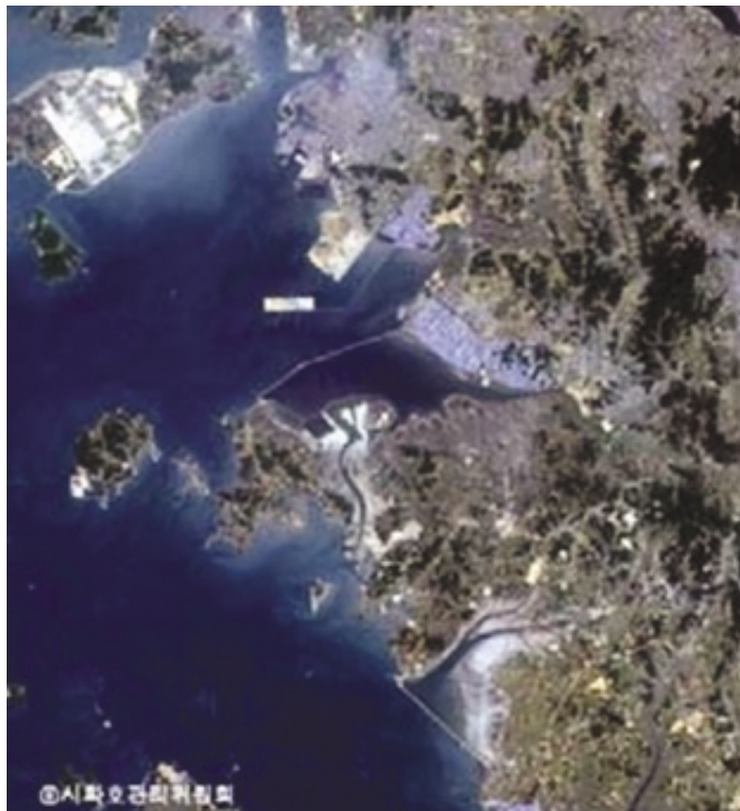
Figure 2. Lake Shi-Hwa and Surrounding Region